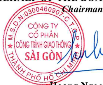
Hoang Ngoc Hung