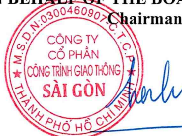
Hoang Ngoc Hung