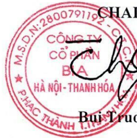
Bui Truong Thang