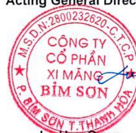
Le Huy Quan