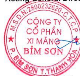
Le Huy Quan